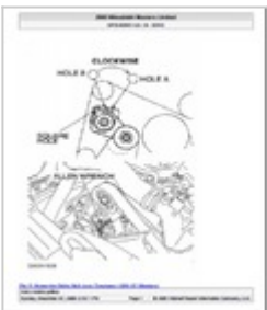
Fig 9 Removing Drive Belt Auto Tensioner 2001 02 Montero

Read online fig 9 removing drive belt auto tensioner 2001 02 montero now available in our site. Free download fig 9 removing drive belt auto tensioner 2001 02 montero also accesible right now.