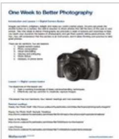
Photo Lesson Plan 1 Digital Camera Basics Walsworth

Read online photo lesson plan 1 digital camera basics walsworth now available in our site. Free download photo lesson plan 1 digital camera basics walsworth also accesible right now.